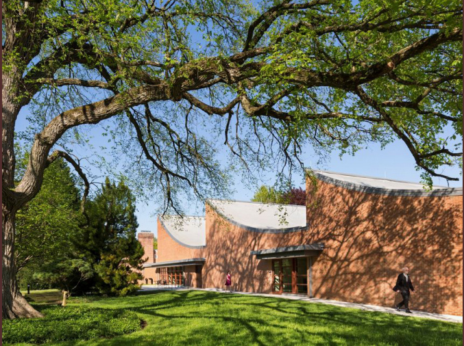
Tanger Arboretum and Campus of History

LANCASTER CAMPUS OF HISTORY OPEN MONDAY-SATURDAY