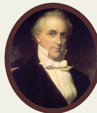
President James Buchanan

Learn about the life and legacy of James Buchanan, the 15th president of the United States, and the family he raised at his beloved home, Wheatland.